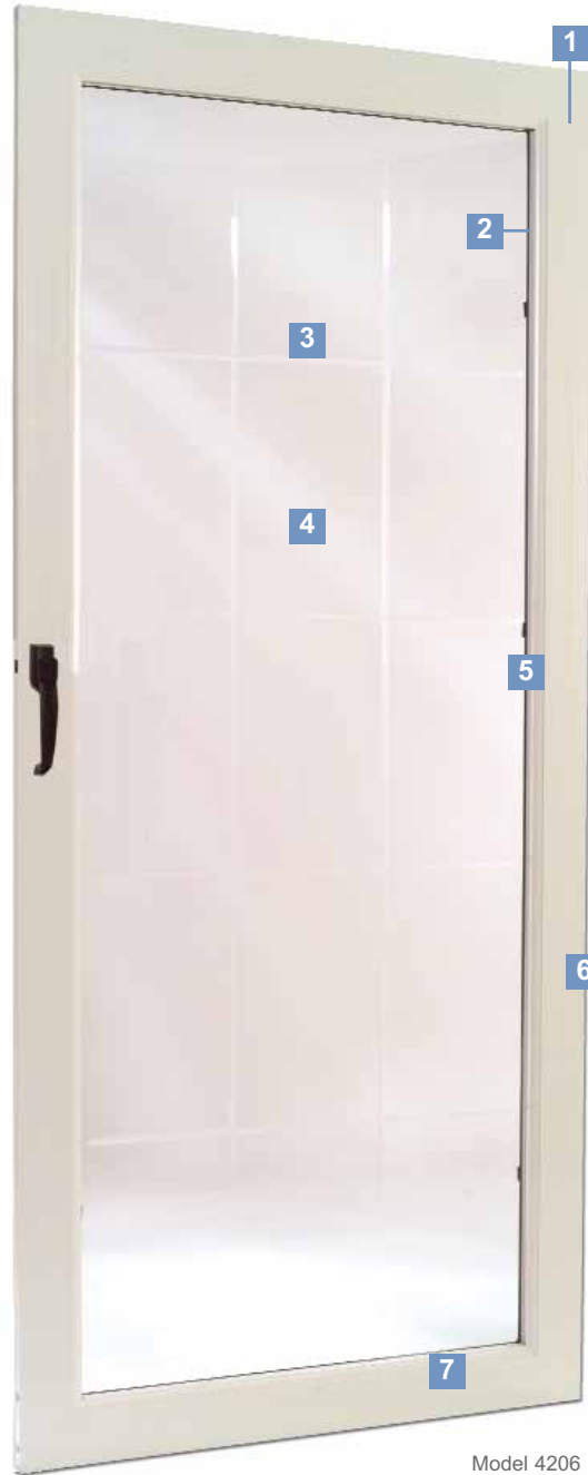
Model 4206 15-lite V-groove storm door in soft white