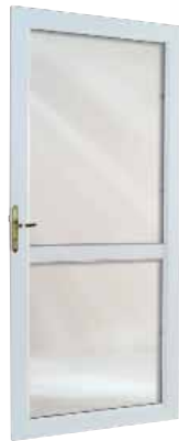
Rochester 4211 with brass mortise hardware