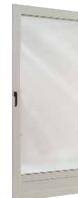
Full View with kick plate 4204 with push- button hardware