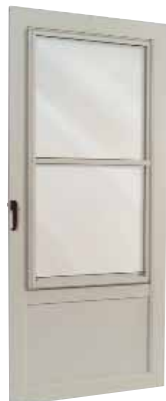
Self-Storing 4210 with push- button hardware