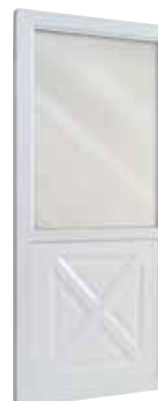
Crossback 4202 with push- button hardware