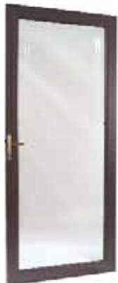
Parisian V-groove 4207 with brass mortise hardware