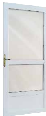
Hi-Lite 4201 with brass mortise hardware

Gorell 4200 Series Storm Doors meet a wide range of needs. They can protect your home's entry door, provide a source of ventilation, add a level of safety or just give you a nice view of the neighborhood.