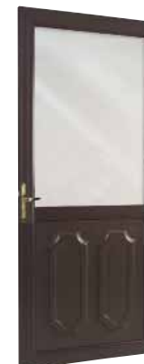
Provincial 4203 with brass mortise hardware