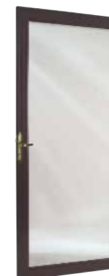
Full View 4205 with brass mortise hardware