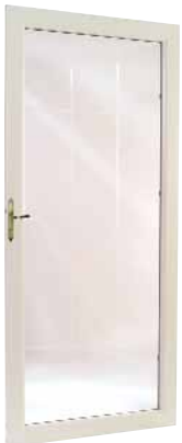
15-Lite V-groove 4206 with brass mortise hardware