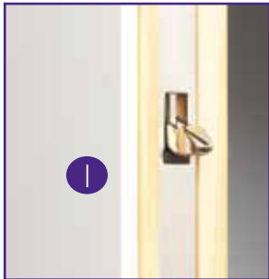
• Available in Pine, Fir and Alder